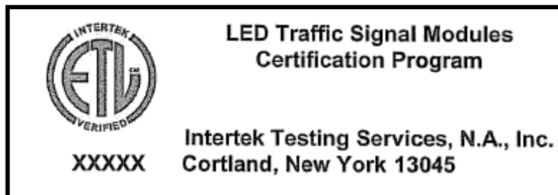
Figure 1. Intertek- ETL Verified Label

6.1.4.3 For firms with business and/or corporate citizenship in the United States of less than seven years, the process by which the end-users/owners of the modules will be able to obtain worst-case, catastrophic warranty service in the event of bankruptcy or cessation-of-operations by the firm supplying the modules within North America, or in the event of bankruptcy or cessation-of-operations by the owner of the factory of origin, shall be clearly disclosed.