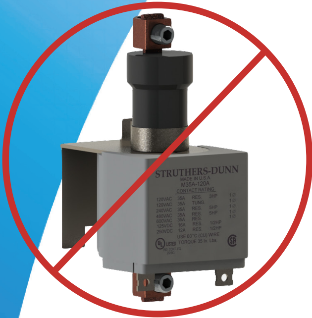
Mercury Displacement Relay

The 418 Series Relay is designed as a direct "drop-in" replacement for existing mercury displacement relays. The 418 Series is a single pole hybrid relay which features an LED indicator to verify circuit power which simplifies trouble-shooting by field maintenance personnel.