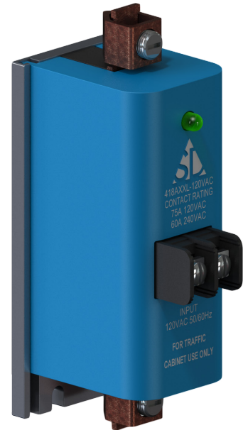
Hybrid Relay Replacement 418 Series