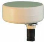
TR-3 / TR-4 GPS Receiver