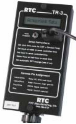
Model TR-3 / TR-4