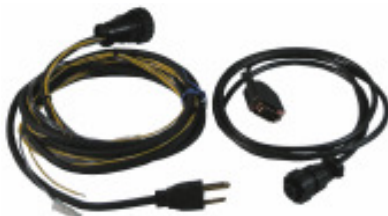
Power Cord and GPS Receiver Harness