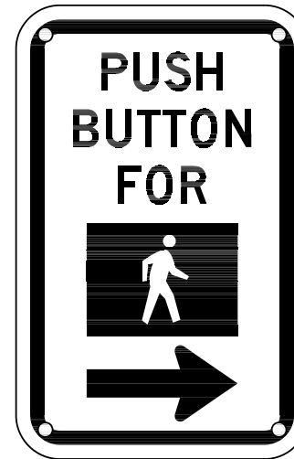
STANDARD OPTION A