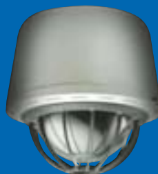
SPECTRA IV IP Day/Night 18X