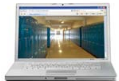
SPECTRA IV IP WEB BROWSER USER INTERFACE

Delivering three high-quality, real-time video IP streams and bi-directional audio, today's security professionals can view and control the industry's leading camera positioning system from virtually anywhere in the world. Coupled with true hybrid functionality that enables simultaneous IP and analog control, Spectra IV IP changes everything we've come to know about network camera systems.