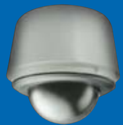
SPECTRA IV IP Color/Low Light 16X