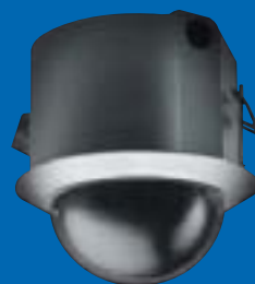
SPECTRA IV IP Day/Night 23X

With Spectra IV IP, the numbers really do add up.