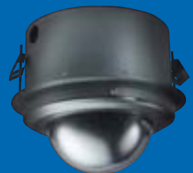
SPECTRA IV IP Color/Low Light 22X