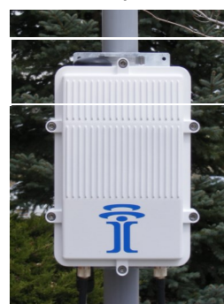
2, 3 and 4 radio options