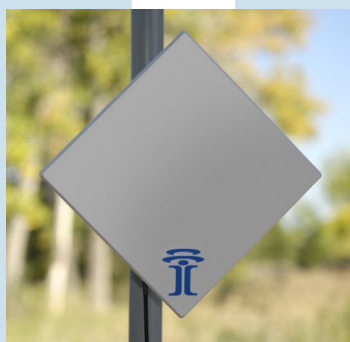
Nitro58™ units include GPS, external RSSI indicator & reset button