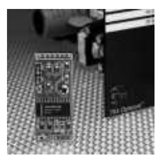
Opticom™ Model 832 Communications Daughter Board