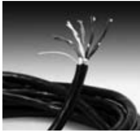
Opticom™ Model 138 Detector Cable