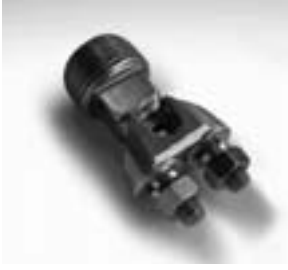
Opticom™ Span Wire Clamp