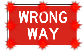
42" x 30" (1067 mm x 762 mm)