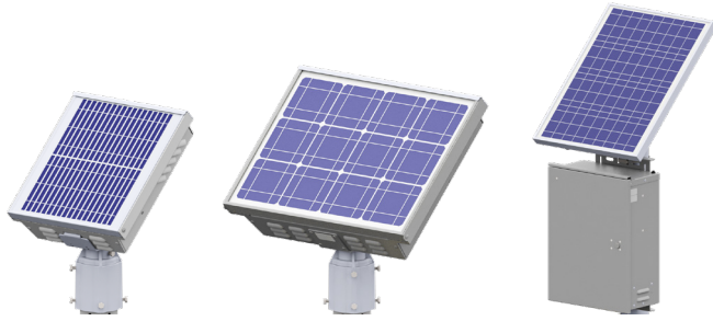
Compact, 15w integrated solar engine