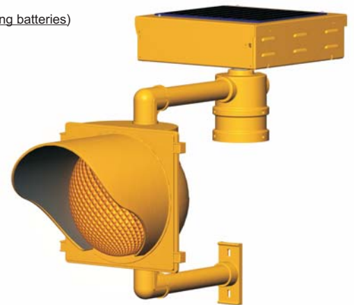
4.5" round sign post installation