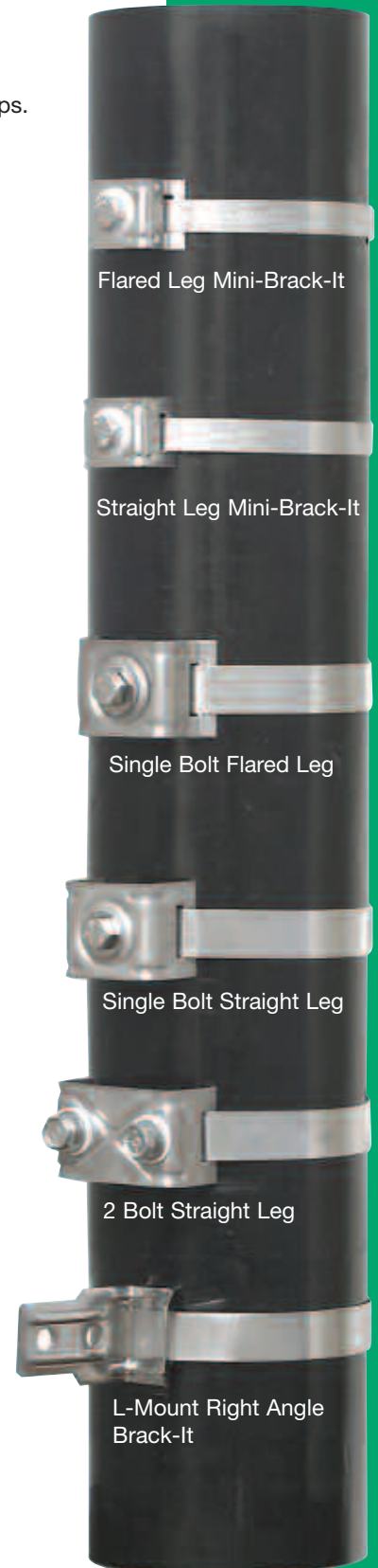
Flared Leg Mini-Brack-It