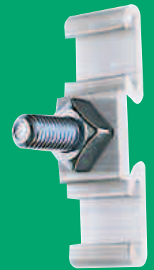
D51089 Mounting Plate