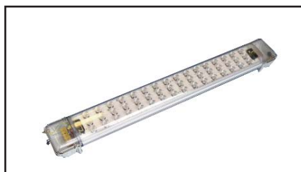
Enclosed, Gasketed 2' & 4' LED Linear Fixture