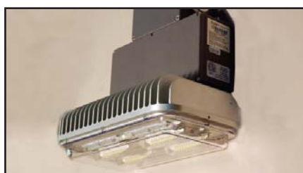
STW Series Multi Purpose Rugged Application LED Fixture