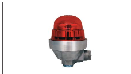
Multi Purpose Visual Indicators