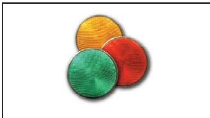
Low Voltage LED Traffic Signal Modules