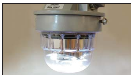
RTO Series LED General Purpose Fixture