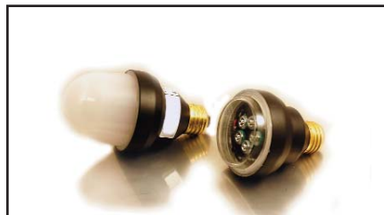
Pre-emption / Red light Running Signal Indicators