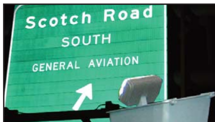
StreetSense™ Series LED Roadway Sign Light