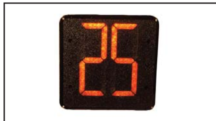
12" x 12" School Zone Speed Limit Indicator