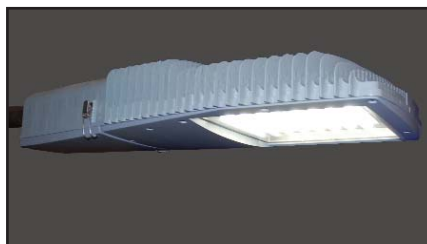
StreetSense™ Series LED Streetlight