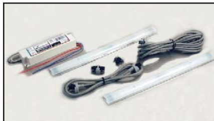
Traffic Cabinet Lighting