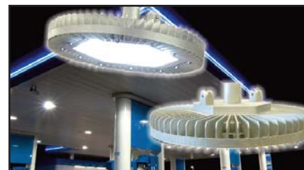
LED Multi Purpose Fixture