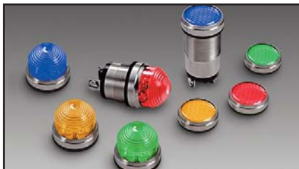
LED Traffic Cabinet Power Status Indicator